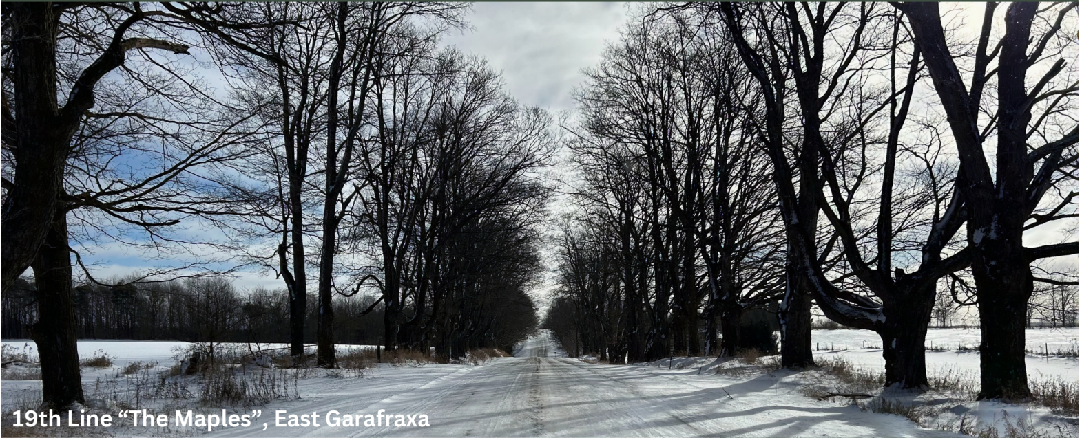
19th Line "The Maples", East Garafraxa