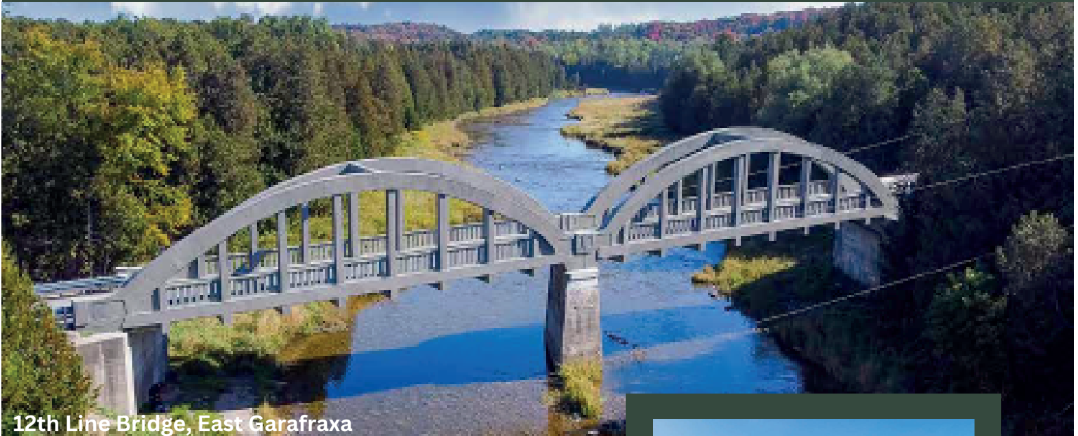
12th Line Bridge, East Garafraxa